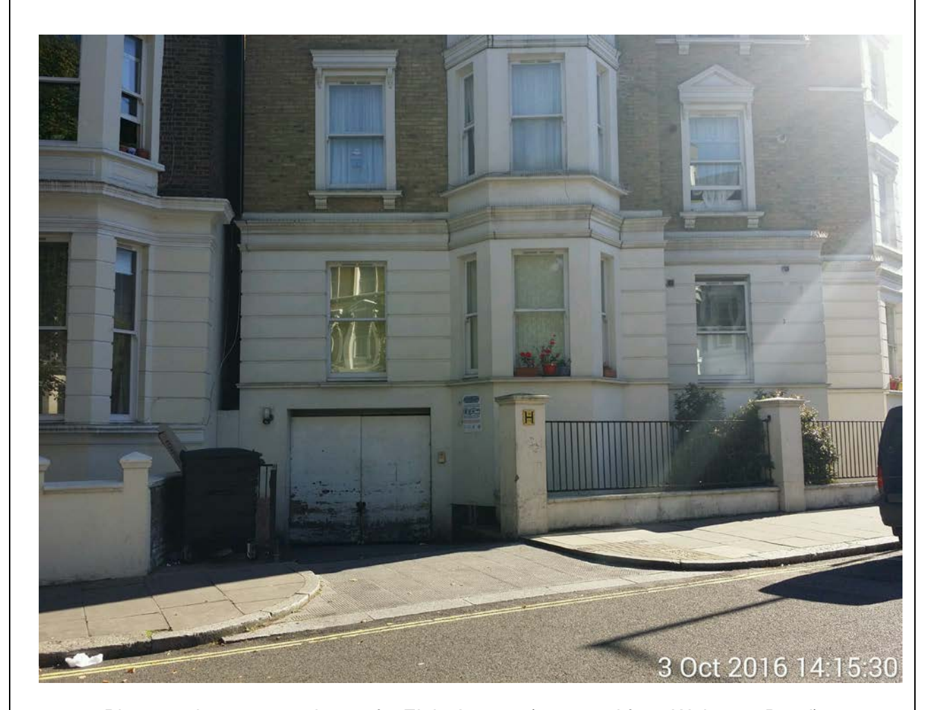
Photo to show garage doors of 1 Elgin Avenue (accessed from Walterton Road)